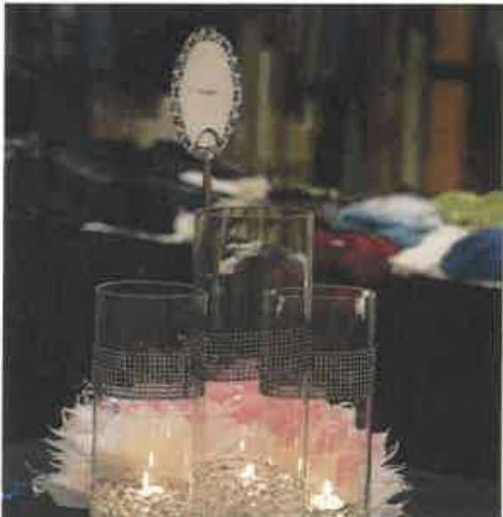
Night of Celebration

What changes, if any, have you noticed in yourself since you have joined Girls Circle? "I am happier"