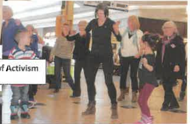
16 Days of Activism